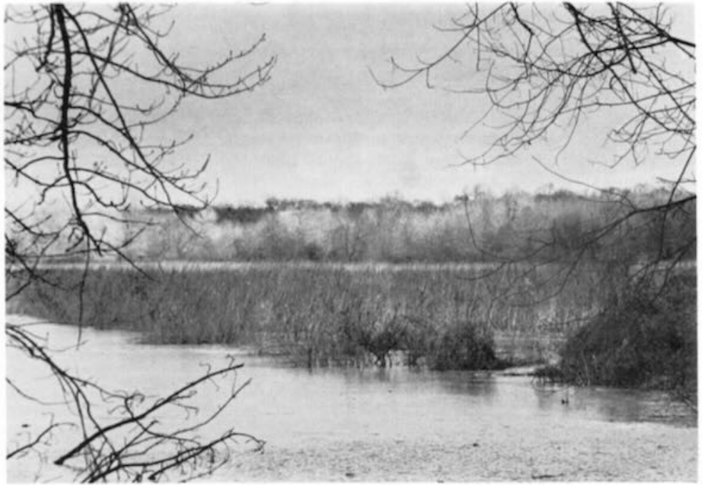
Celery Farm habitat.

Willow Flycatcher has been breeding at the Celery Farm for many years as has Mallard , Wood Duck and Canada Goose . Both Virginia Rail and Sora nest there as does Long-billed Marsh Wren . American Bittern is uncommon in spring and summer. Common Snipe is just that, especially in early spring. Bobolinks are heard, if not seen, in May, September and October. Sparrows are most numerous in the fields on the western and northern parts of the preserve. Song Sparrows and Swamp Sparrows nest in goodly numbers, and Field , White-Throated , Tree and Savannah Sparrows are present in migration. White-crowned Sparrow is more likely to be encountered in autumn, and Lincoln's Sparrow may be found in fall by diligent searching. Beginning in September, some one or